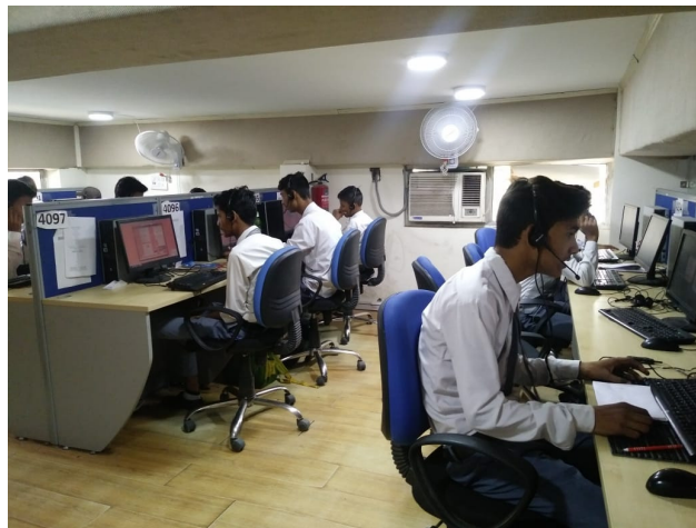
Students involved at different workplaces during Internship.