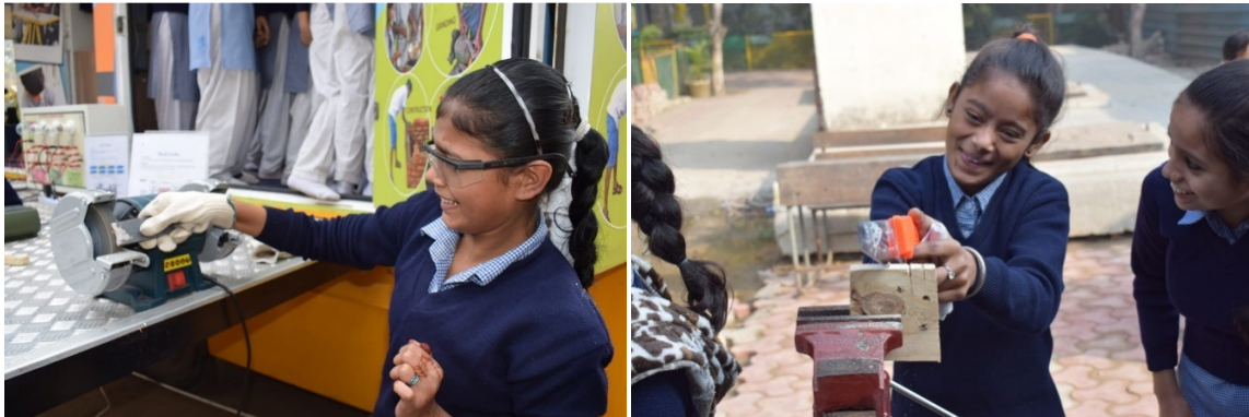
Caption: Students getting hand on in Multi skills equipment during 'Skills on Wheels' Visit.