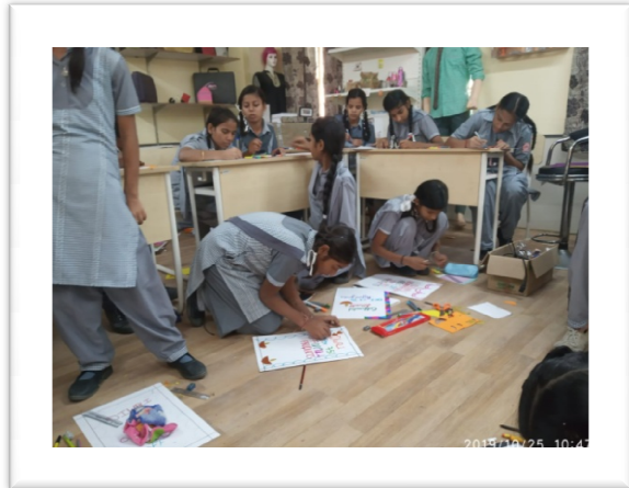
Retail Students of class 11 th and 12 th participating in Skill Competition