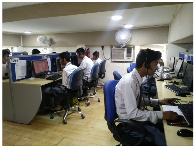
Students involved at different workplaces during Internship.