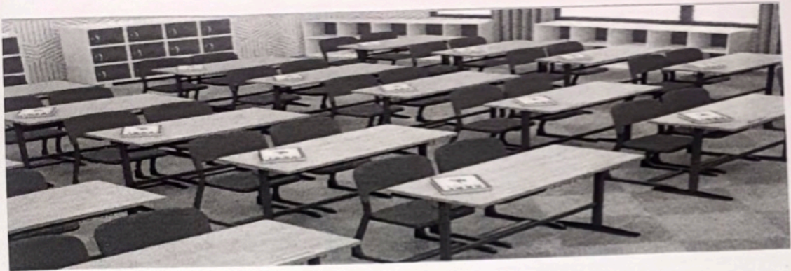
Some illustration of the Placement of ECCE Cabinets in the Classrooms